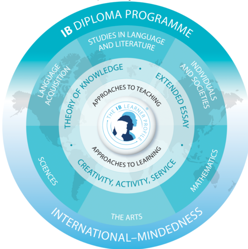
The Diploma Programme model